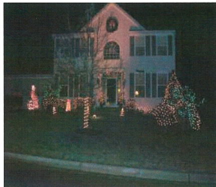
Second Place Winner