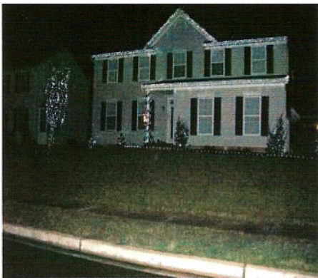
First Place Winner