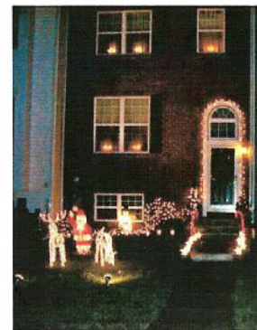
Third Place Winner