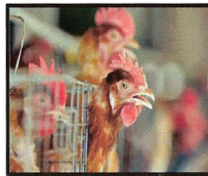
What should you know about the Avian Flu.

2. Will a flu shot protect me? No. There is no vaccine currently available for the Avian flu. 3. Have there been any cases of Avian flu in the U.S.? Not yet. There have been no reported cases